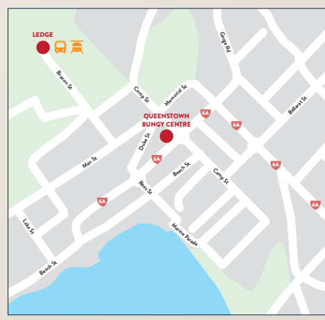
*Travel time without traffic